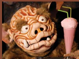
The Big Ugly Monster